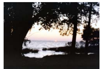
Sunset at Stickville