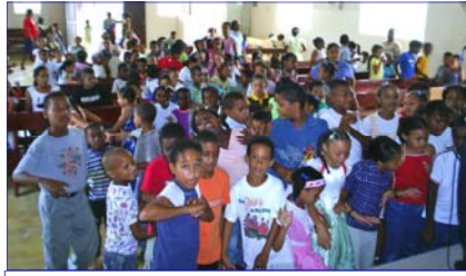
Children in the Dominican Republic responding to Jesus' invitation to join His family.

At Liberty, we watched as children chose to bring their brokenness, fears and hurts to Jesus and to sense His love and